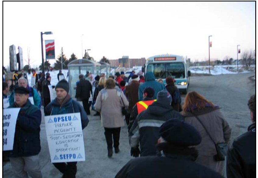
Some of the pickets at St. Lawrence

The picketers were disappointed that Kingston television did not bother to cover the activity despite their heavy presence inside at the dinner.