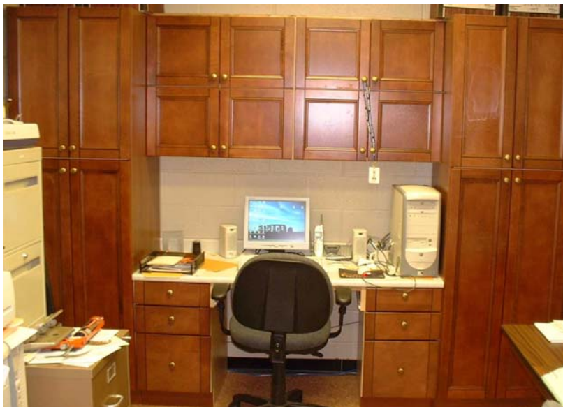
New cupboards in the Union office have greatly improved storage capacity and working space

provides $7,000 to purchase 2 Automatic External Defibrillators to be donated to and installed in Loyalist College.