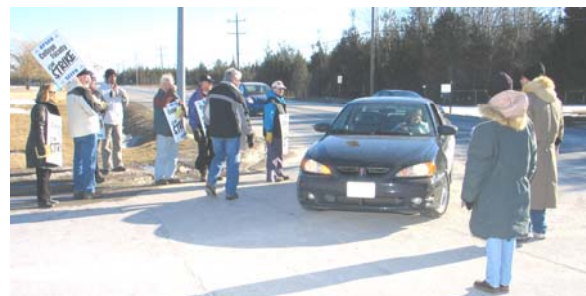
Day One, Kente Entrance